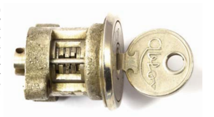
An early Abloy factory cutaway cylinder showing the rotating discs with the side bar resting on their peripheries, the key rotates to align slots in the discs to align with the side bar allowing it to drop into the slots thereby providing the drive on further rotation.

Another global traveller researching ideas and methods was Theodor Kromer. He travelled the world in the 19th century probing and learning how others solved the security problems and the merits and weaknesses of their solutions. This mind-set and constant evaluation made Kromers' locks the first choice for