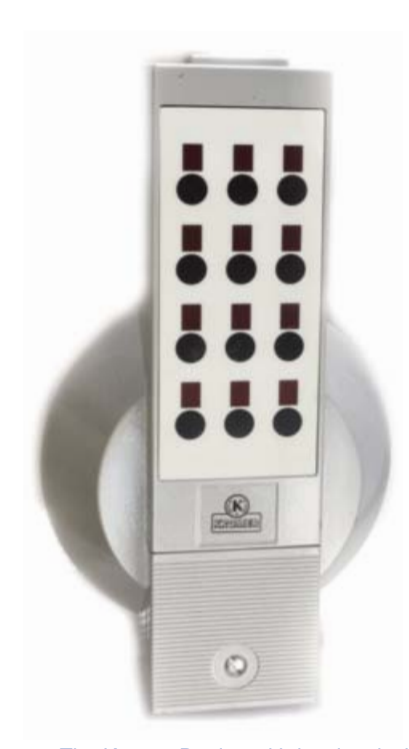
The Kromer Duplex with its electrical, Enigma inspired, keypad. The input keys were randomised for every input digit and automatically scrambled after a few seconds. One advantage of this motor 3 or 4 wheel mechanical combination lock. remove this possibility.