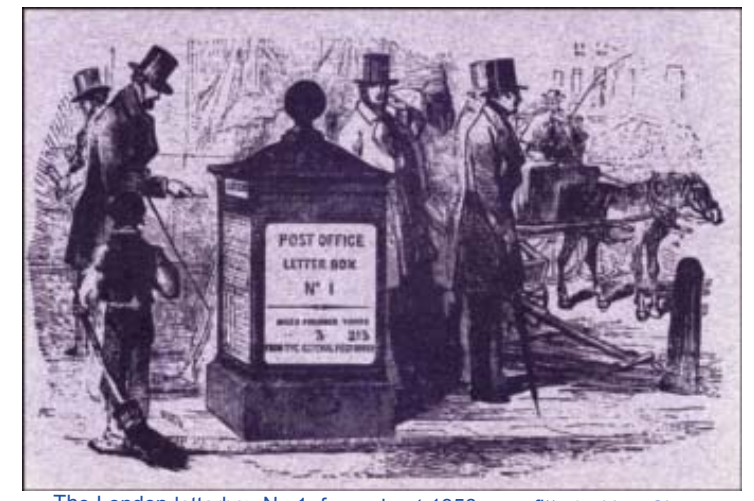
The London letterbox No.1, from about 1856, was fitted with a Chubb Lock,

post-offices. The designs for the first two stamps carried a Greek temple on one and the Smith and Hawkes/Chubb letterbox on the other. Incidently fifty of these boxes were ordered at a cost of £9 18s 0d. each The locks cost 14 shillings each. Thirty-two were set up in London, eleven in Edinburgh and seven in Dublin. Like the boxes in Paris, they were all painted bronze."