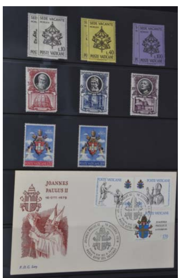
A page from the HoL stamp album. The Vatican city and countries with a strong Papal following are good contenders for stamps featuring keys.

Since the aforementioned catalogue was published quite a few additional stamps have been added to our collection, some such as the Isle of Man issue featuring the Milner tower high on the cliffs overlooking Port Erin. This is where historical knowledge and the back stories greatly enhance a collection. Another association for the stamp collector would naturally include bank notes, coins and also post box locks of which there were quite a few designs.